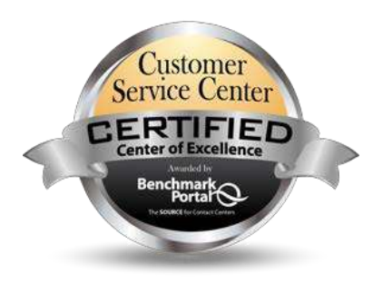
Recognized as a "Certified Center of Excellence" for seven years in a row by Benchmark Portal, Aetna Vision provides one of the vision industry's best customer service experiences. Currently ranked #10 in the top 100 call centers.